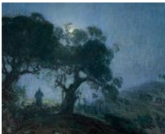
Tanner, Henry Ossawa, 1859-1937. Good Shepherd, from Art in the Christian Tradition , a project of the Vanderbilt Divinity Library, Nashville, TN. https://diglib.library.vanderbilt.edu/act-imagelink.pl?RC=57405 [retrieved April 16, 2024]. Original source: https://commons.wikimedia.org/wiki/File:Henry_Ossawa_Tanner_-_The_Good_Shepherd_-_Google_Art_Project.jpg

Once I was lined up at a large supermarket chain and I was fifty cents short, and a perfect stranger gave me fifty cents. Another time my local greengrocer told me to pay next time when I was a dollar short. This may seem a tiny gesture of kindness but it's not about the money, it's about being there for me and being kind and compassionate.