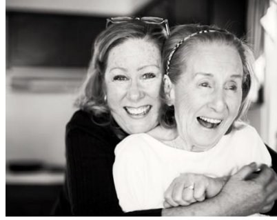
RCL – Love and Happiness