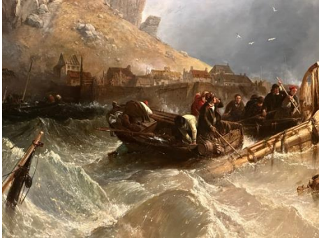
Old Master painting

People are remembered for their love. Congregations are remembered for their love.