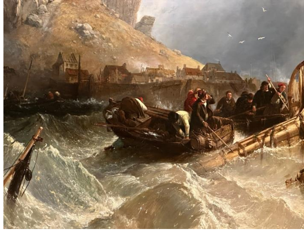
Old Master Painting

In the name of the Father, the Son, and the Holy Spirit, amen.