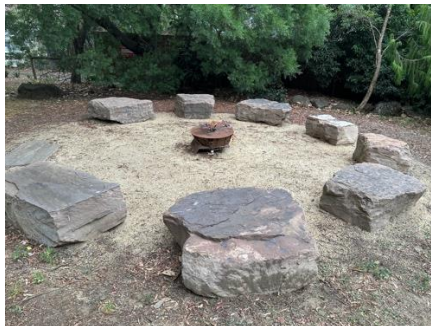
St Margaret's Anglican Church, Eltham